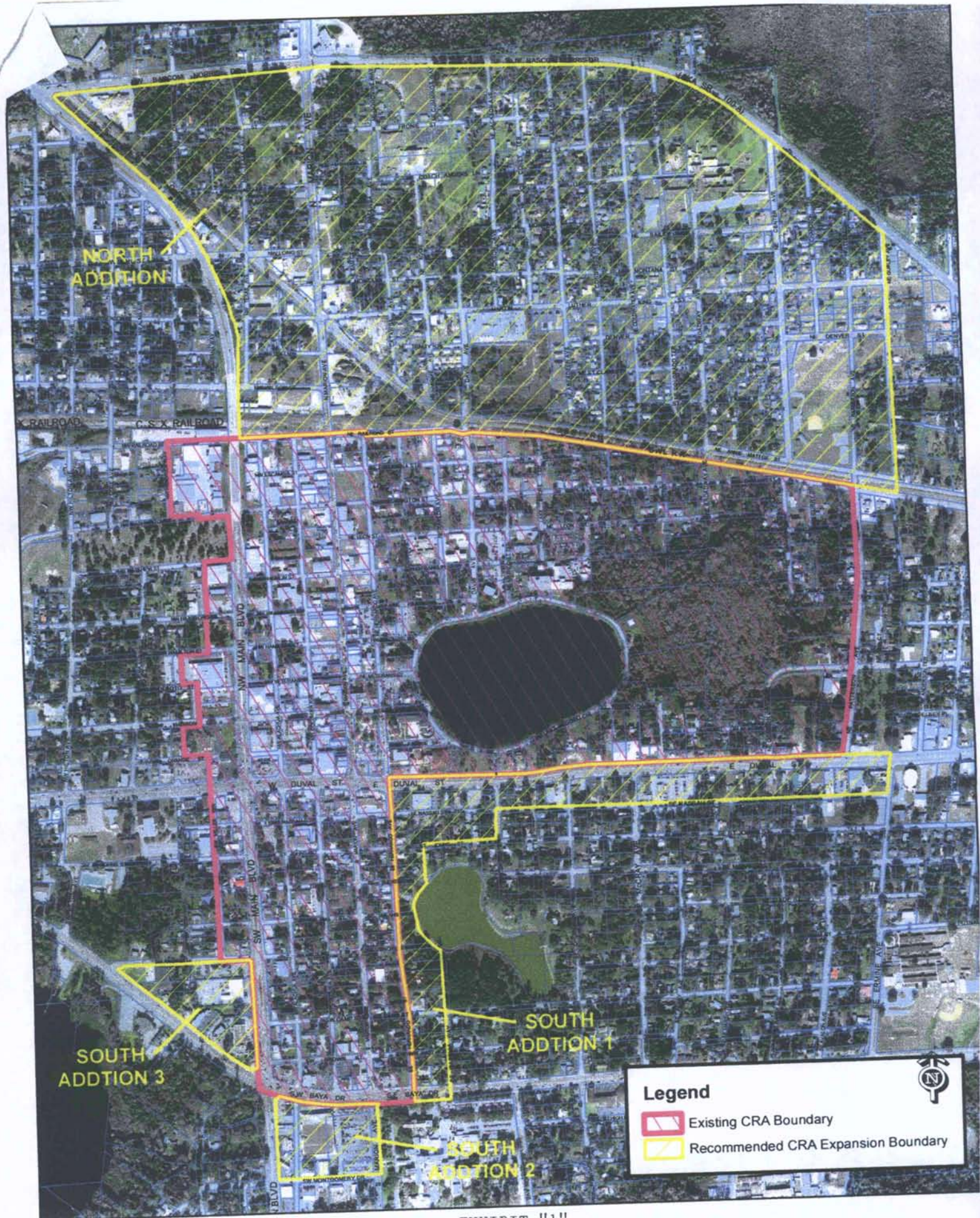
EXHIBIT "1" TO RESOLUTION NO. 2011-01